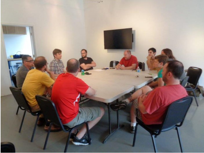
MMCS 2016 Round Table

their concert performance during the Mizzou International Composers Festival. The final stunning Saturday evening was spent at the Wenwood Farm Winery for drinks and live music.