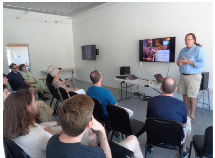
MMCS 2016 Honour Presentation

Most of the week was spent working and discussing music at the Arts Center or in the studios, but several optional excursions were arranged. Some of the participants travelled to the nearby town of Owensville to attend the Gasconade County Fair and its demolition derby. The following day, a group drove up to Columbia, MO to attend rehearsals of new music ensemble Alarm Will Sound as they prepared for