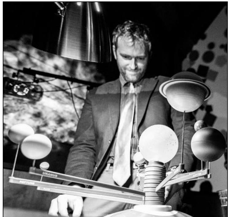
Composer Chester Udell

The software enables you to quickly, visually, and intuitively route your sensor data to control virtually anything on your computer using MIDI, OpenSoundControl, and DMX (lights). The software also emulates keypad and mouse commands, enabling you to control video games, web