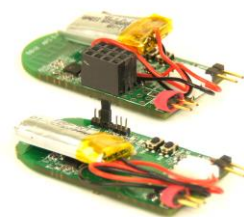
Twist and Accelerate Battery