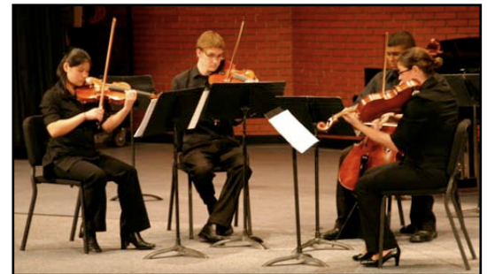
SHSU String Quartet